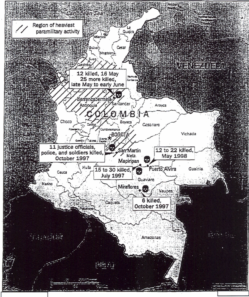
Colombia: Paramilitary High-Profile Activities Since October 1997

Withheld under statutory authority of the Central Intelligence Agency Act of 1949 (50 U.S.C., section 403g)