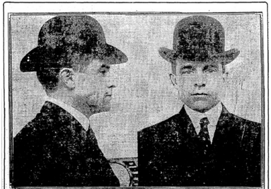
Left: A color drawing from the Seattle Post-Intelligencer shows Adams stealing gold in a "poke." A federal investigation learned his technique of extracting a small amount of gold dust from each miner's deposit and replacing the weight taken with black mineral sand similar to that found in streams and beaches of the Alaska goldfields. Right: George Edward Adams in his arrest image in late November 1905. Before his arrest, he had stolen roughly $250,000 from miners bringing gold dust from the Yukon to exchange for U.S. currency.