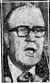
Clarence M. Kelley

Appearing before the Senate Intelligence Committee, Kelley did not name those who led the campaign of wire tapping, bugging and harassment in the 1960s. But Senate testimony has shown that the late FBI Director J. Edgar Hoover was anxious to discredit Dr. King, who had criticized the bureau for using allegedly antiblack agents in the South.