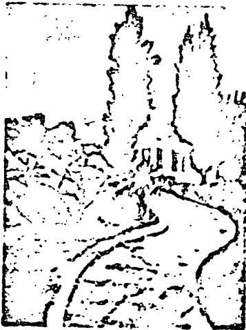
Сочи. Домик Н. А. Островского