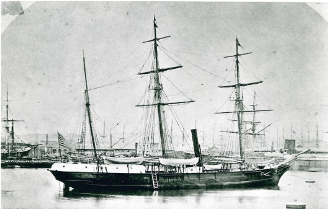
USS Jeannette

On July 8, 1879, the USS Jeannette set sail from San Francisco in a daring attempt to reach the North Pole by pioneering a route from the Pacific Ocean through the Bering Strait.