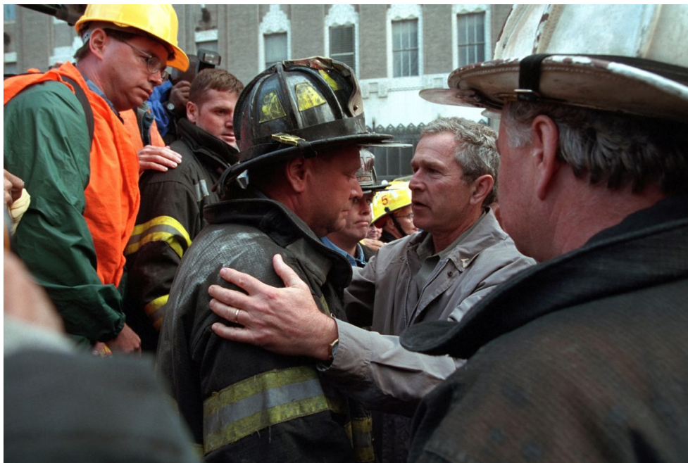
President George W. Bush embraces a firefighter at the site of the World Trade Center during his visit to New York City.

View the collection of 9/11 photographs from the George W. Bush Presidential Library , and a selection of photographs in the National Archives Catalog .