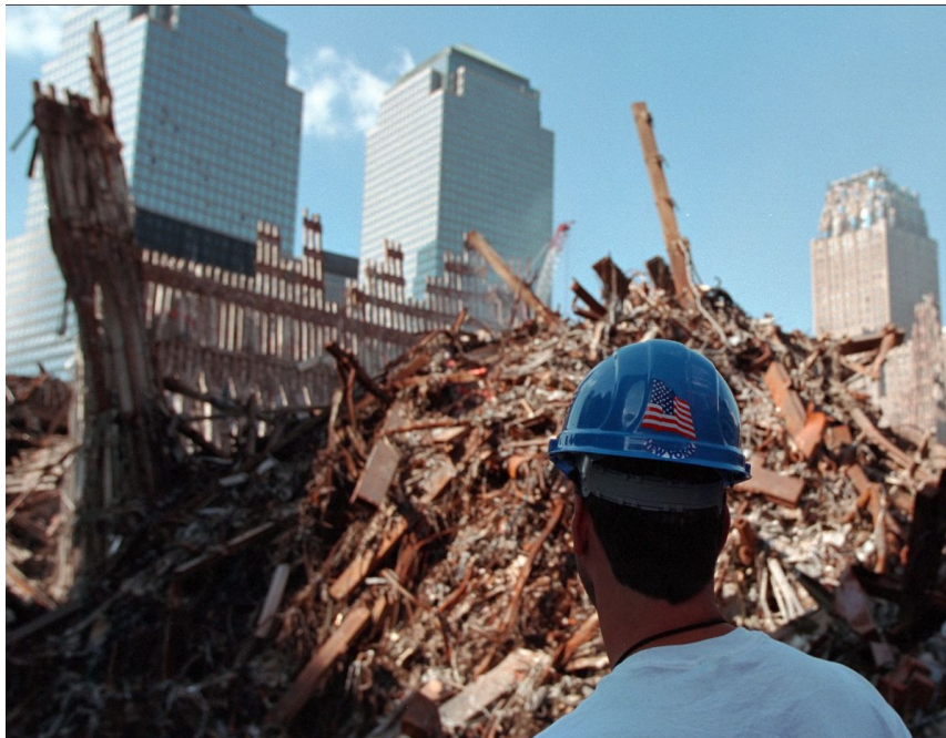
A worker stands at Ground Zero in New York City. National Archives Identifier 5997364