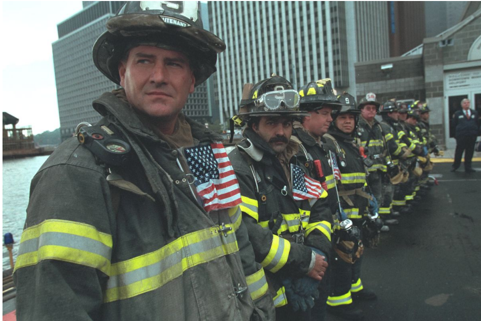
Firefighters await the arrival of President George W. Bush to Port Authority in New York City.

View the collection of 9/11 photographs from the George W. Bush Presidential Library , and a selection of photographs in the National Archives Catalog .