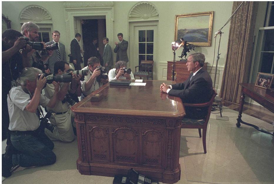
President George W. Bush Before an Address to the Nation Regarding the Day's Terrorist Attacks from the Oval Office, 9/11/2001.